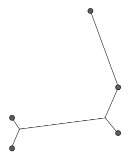
Figure 1: A Steiner tree connecting points at (.7,.96), (.88,.46), (.88,.16), (.19,.26), (.19,.06) (where (0,0) is in the lower left corner, and (1,1) in the upper right). There are two Steiner vertices, at roughly (.24,.19) and (.80,.26).

a pretty sophisticated idea of why we have no idea [62]. See [69] or [40] for more information.